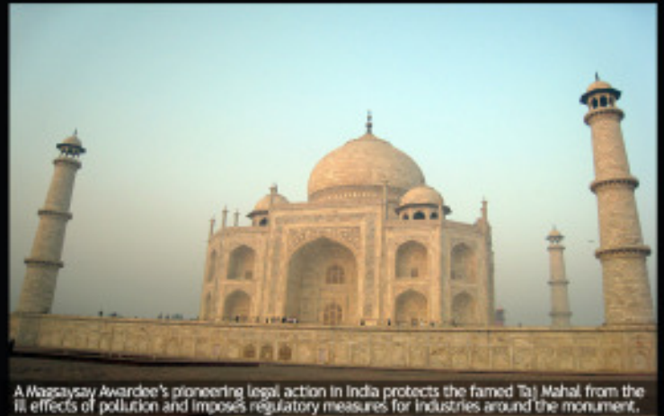
A Magsaysay Awardee's pioneering legal action in India protects the famed Taj Mahal from the ill effects of pollution and imposes regulatory measures for industries around the monument.