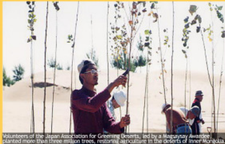
Volunteers of the Japan Association for Greening Deserts, led by a Magsaysay Awardee, planted more than three million trees, restoring agriculture in the deserts of Inner Mongolia.