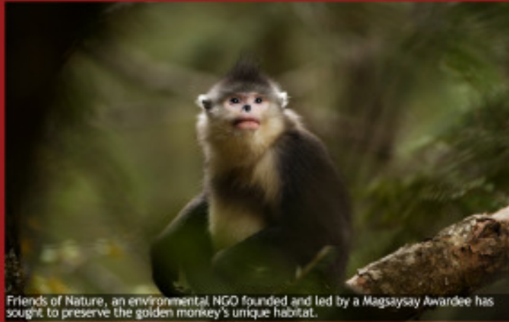
Friends of Nature, an environmental NGO founded and led by a Magsaysay Awardee has sought to preserve the golden monkey's unique habitat.